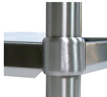
L = LEFT BOWL R = RIGHT BOWL